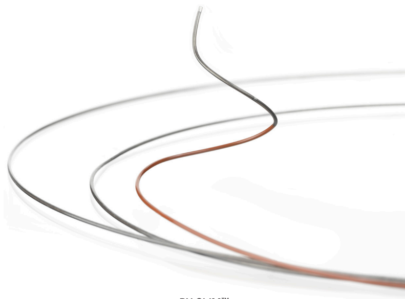
PX SLIM™ Delivery Microcatheter