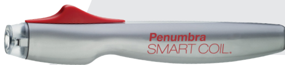
Penumbra SMART COIL Detachment Handle