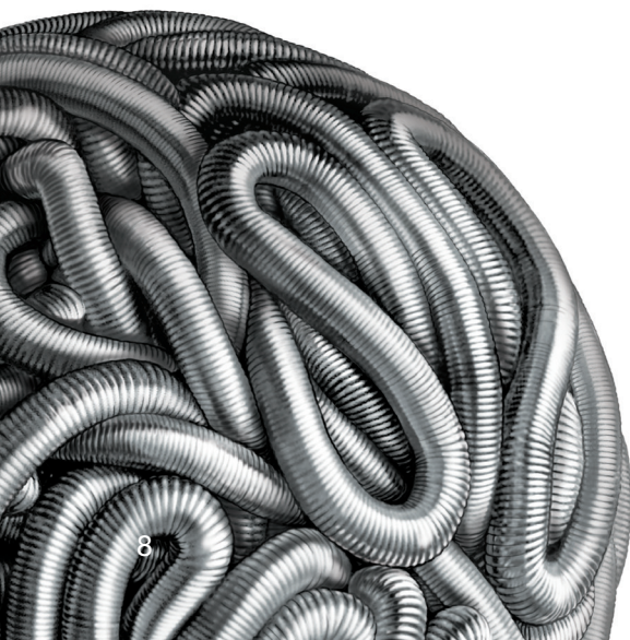
Penumbra Coil 400™