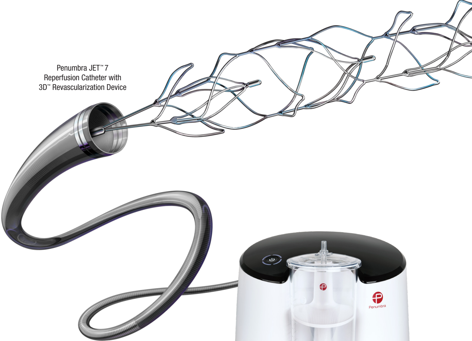
Penumbra JET™ 7 Reperfusion Catheter with 3D™ Revascularization Device